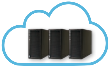
RISCO Cloud Server